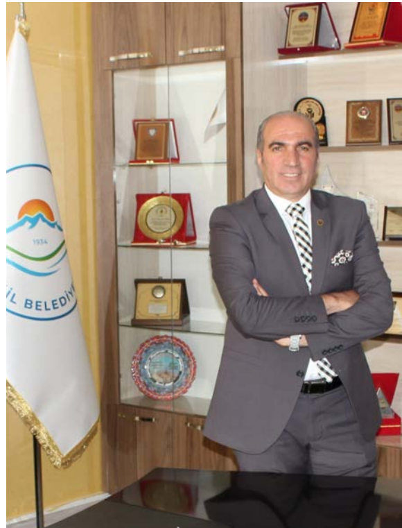
The mayor of Diyarbakır's Eğil district, Mustafa Akkul, is pictured above December 23, 2019. He was removed from office and arrested in March 2020 for supposedly helping a man join the PKK.

of AKP-appointed mayors is seen as inseparable from the repression that has accompanied the past five years of violence. Widespread military curfews have been lifted but individuals remain subject to arrest and detention on a regular basis. Moreover, the judicial system often seems to let vigilante violence against the HDP go unpunished. In April, armed men threatened the mayor of Kars following a dispute over a government contract. Charges were dropped when the perpetrators explained that they had not intended to smash up the furniture in his