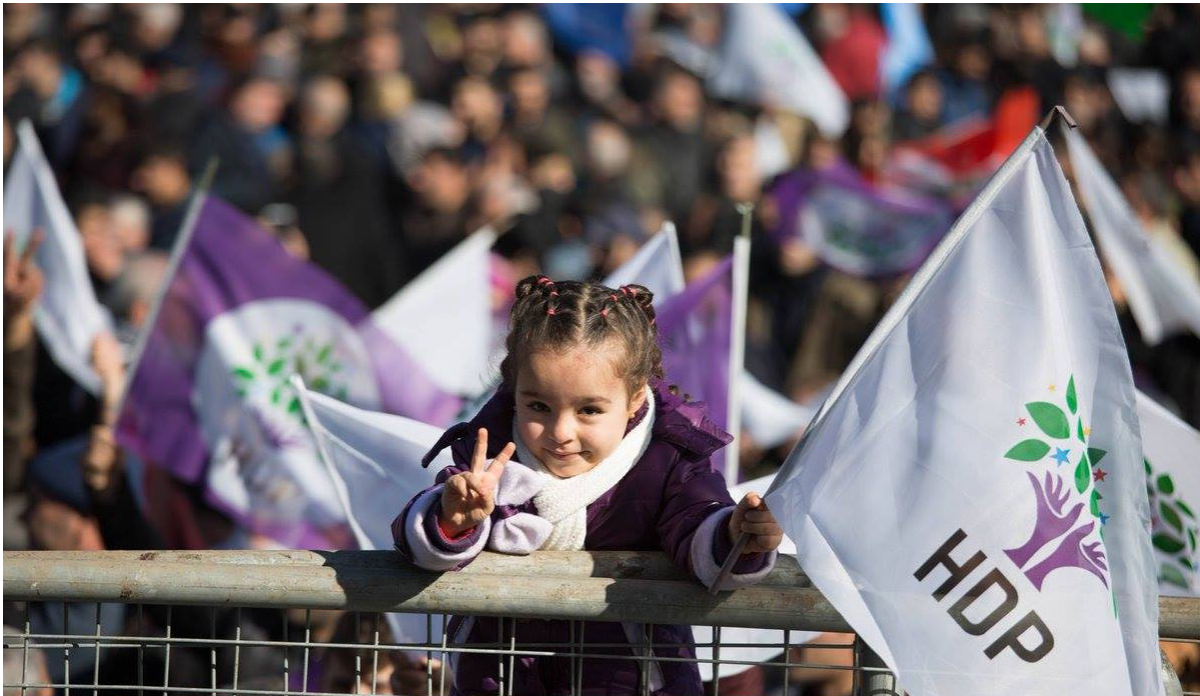
A young girl poses on January 19, 2019, during an HDP rally ahead of the March 2019 elections.

undemocratically overturn the outcome, the HDP argued, Erdoğan sought to instill a sense of futility among HDP voters in order to suppress their turnout.