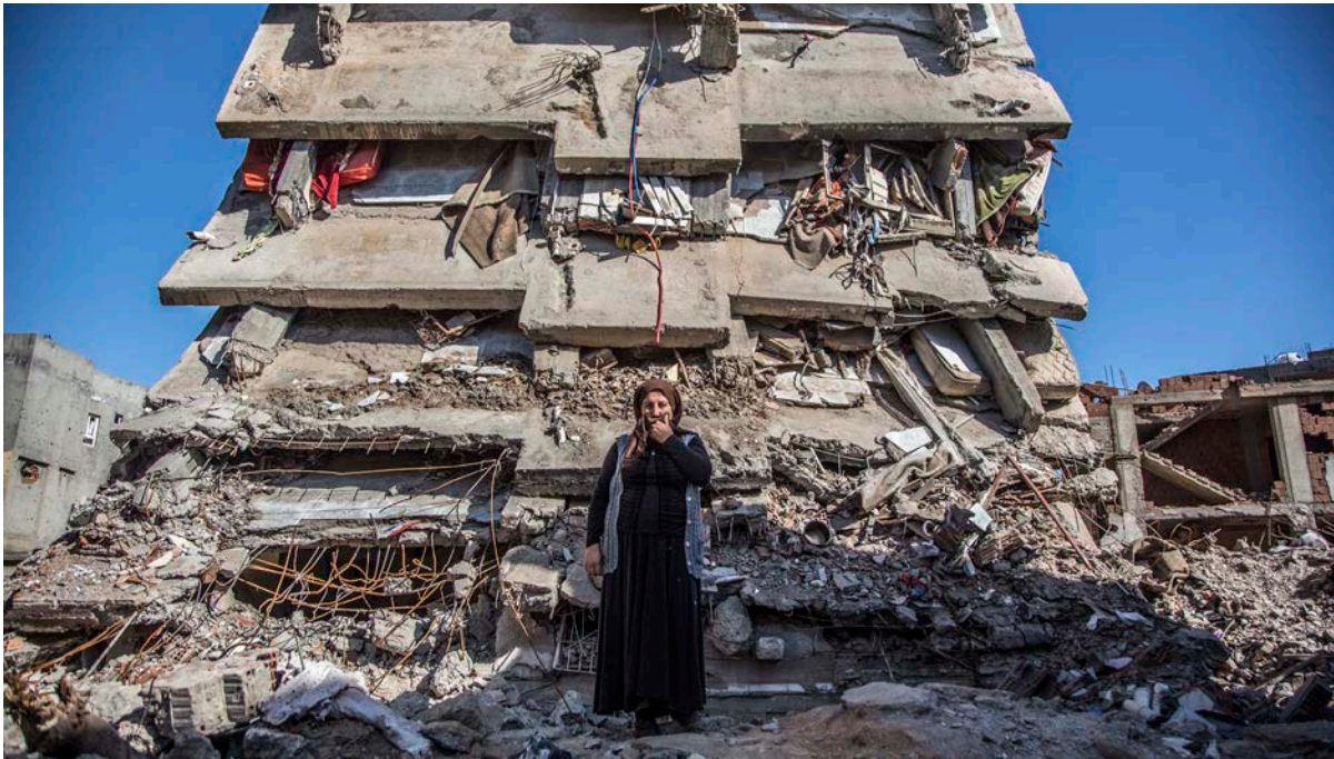
A Kurdish woman stands before a demolished building in Cizre, southeast Turkey, during clashes between security forces and Kurdish insurgents on March 2, 2016.

transform Turkey's political dynamics. The Kurdish nationalist movement has maintained the support of roughly half of Turkey's Kurdish population, giving the HDP significant electoral majorities in many predominantly Kurdish southeastern provinces. 3