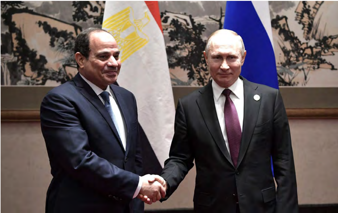
Russian President Vladimir Putin had a meeting with Egyptian President Abdel Fattah al-Sisi.

unlikely to change that reality, despite threats by Egyptian officials to the contrary. 38