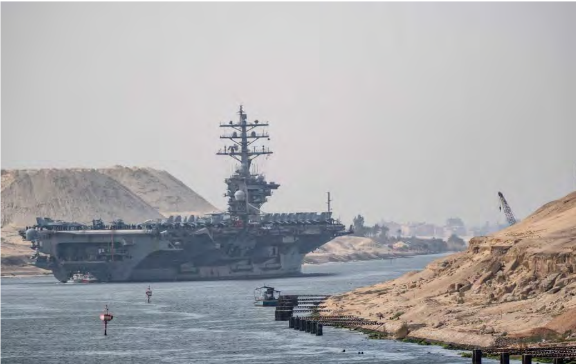
The aircraft carrier USS Dwight D. Eisenhower transits the Suez Canal on March 9, 2020. Egypt's control of the Suez Canal is one reason the country holds continued importance for the United States.

equipment to within the four pillars of fighting terrorism and bolstering border, maritime, and Sinai security. Recent FMS notifications indicate that the Egyptian government continues to prefer sustaining patronage networks rather than using U.S. largesse to enhance their capabilities to address the country's legitimate security threats.