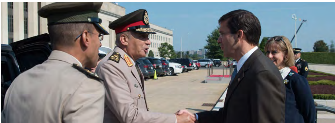
U.S. Secretary of Defense Dr. Mark T. Esper meets with Egyptian Minister of Defense Colonel Gen. Mohamed Ahmed Zaki at the Pentagon, Washington, D.C., July 29, 2019.