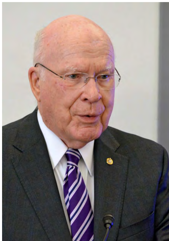
Senator Patrick Leahy (D-VT) gives remarks during the event "Al-Sisi in Washington: Egyptian President Seeks Support for Power Grab" on April 9, 2019.

These holds placed on U.S. military aid and conditioned on specific improvements have shown that using aid as leverage can work, particularly if Congress and the administration are in agreement. U.S. leverage does have its limits, however. Conditioning military aid would not be able to turn al-Sisi into a democrat, but it can have a significant impact on issues deemed important enough to put significant weight behind.