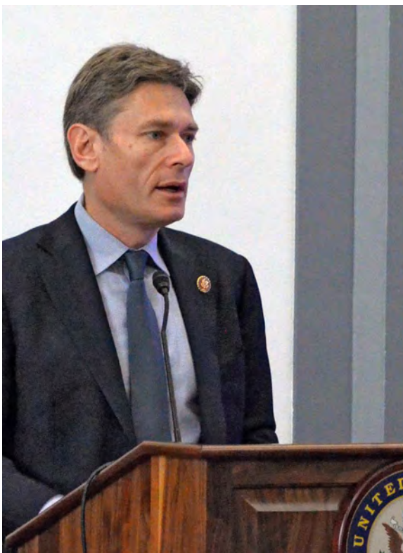
Representative Tom Malinowski (D-NJ) gives remarks during the event "Al-Sisi in Washington: Egyptian President Seeks Support for Power Grab" in Washington, D.C., on April 9, 2019.

campaign has included home demolitions and other collective punishment measures, depriving Egyptians in the Sinai of their rights and livelihood.