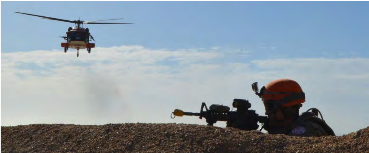
Troopers assigned to Apache Troop, 1st Squadron, 2nd Cavalry Regiment, participate in a land-to-air-to-sea casualty evacuation training exercise in the Sinai Peninsula, Egypt, January 22, 2016.

CAATSA sanctions as required by law. 14 In November 2019, it was reported that Secretary of Defense Mark Esper and Secretary Pompeo sent a letter to Egyptian Minister of Defense Mohamed Ahmed Zaki urging the Egyptians to cancel the Su-35 deal or risk sanctions. 15 If the Egyptian military completes the deal, CAATSA requires economic sanctions on the individuals and agencies within the military involved in the purchase. Along with possible restrictions within the U.S. banking system, the sanctions could threaten the $1.3 billion in military aid Egypt receives annually from the United States.