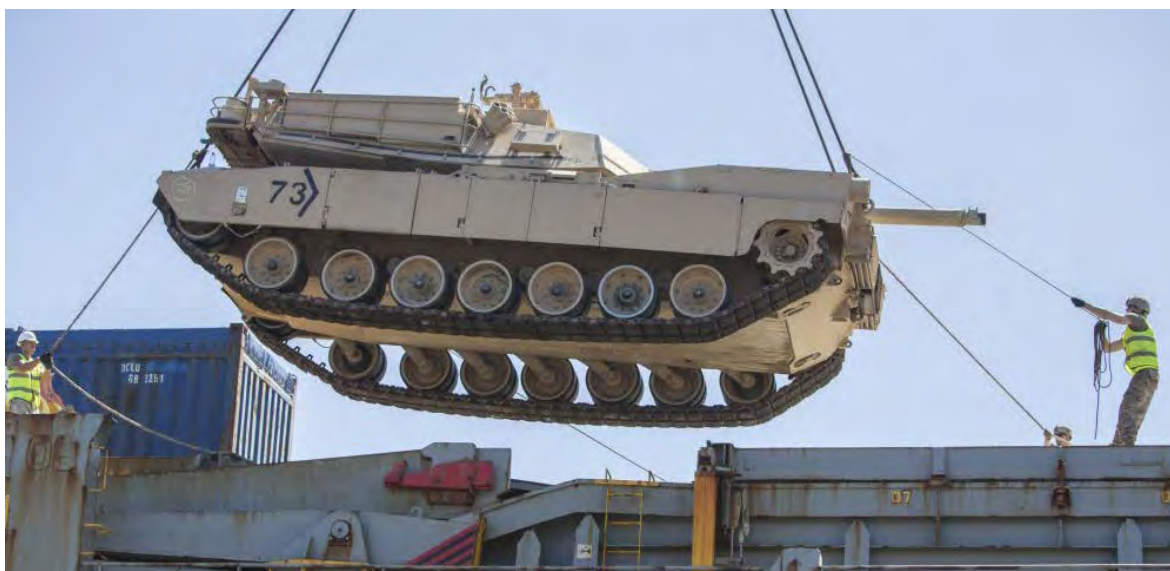
Soldiers stabilize an M1 Abrams battle tank during an equipment offload in Alexandria, Egypt, in preparation for Exercise Bright Star 2017.