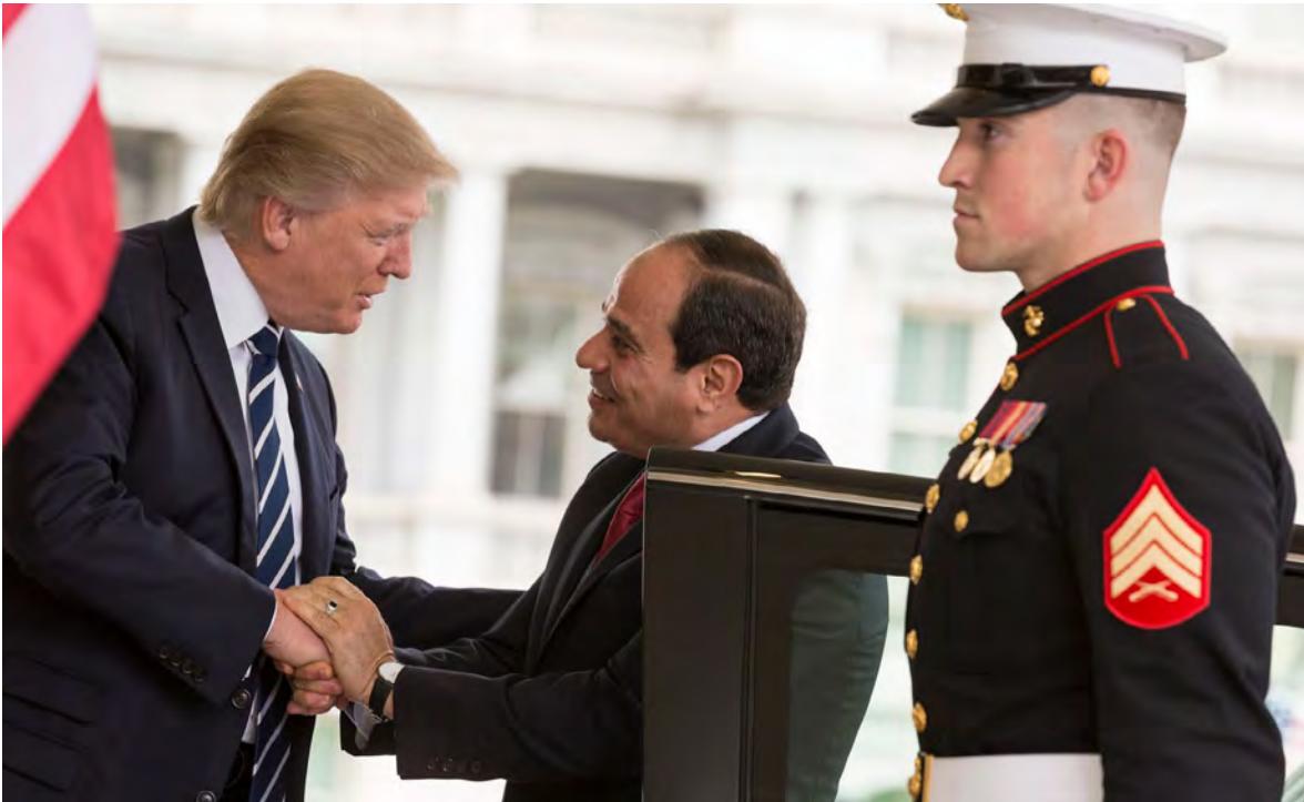
U.S. President Donald Trump welcomes Egyptian President Abdel Fattah al-Sisi to the White House, April 3, 2017.

know, in case there was any doubt, that we are very much behind President el-Sisi [sic]. . . He's done a fantastic job in a very difficult situation." 7 Then while waiting to meet with al-Sisi on the side of the 2019 Group of Seven Summit in France, Trump reportedly called out, "Where's my favorite dictator?" 8