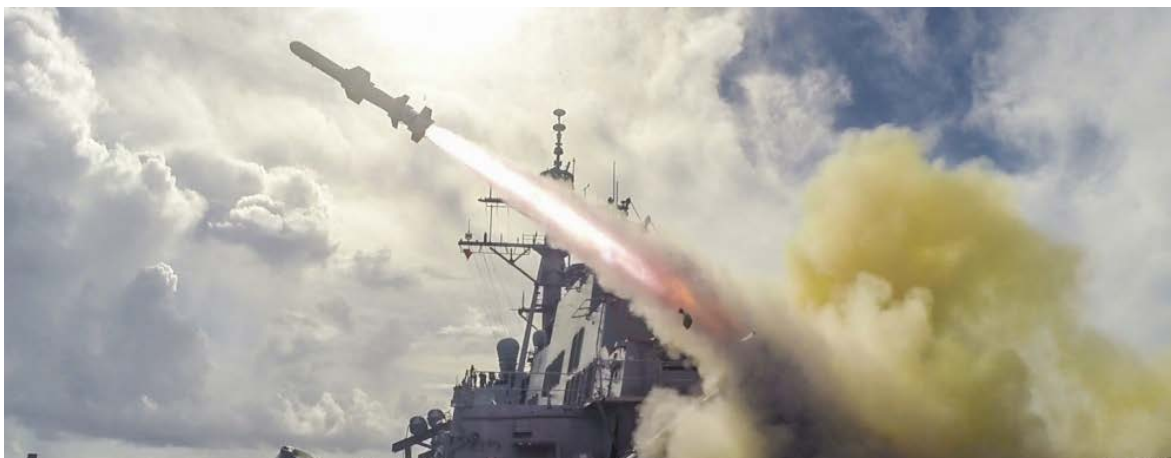
The Arleigh Burke-class guided-missile destroyer USS Fitzgerald (DDG 62) fires a Harpoon missile during a live-fire drill near Guam, August 15, 2015.