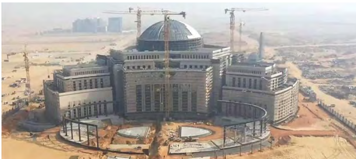
The military has taken a central role in multibillion dollar megaprojects such as the construction of Egypt's new administrative capital 30 miles east of Cairo.