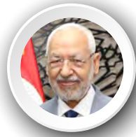
RACHED GHANNOUCHI Ennahda party president