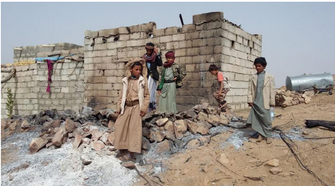
Children in al-Bayda' Province standing near the location of a January 2017 U.S. raid against AQAP.