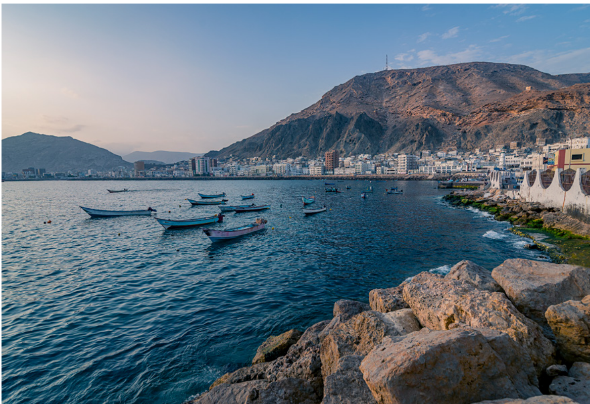
The coastal city of Mukalla in Hadramout Province in Yemen's southeast was captured by AQAP fighters in 2015 and ruled by the group until 2016, when tribal mediation helped push out AQAP.

In its second governing experiment, AQAP tried to present itself as a less brutal group. 43 It did not raise al-Qaeda's black flag or even present itself as AQAP or AAS, instead ruling through local sympathizers and using neutral-sounding names such as "Sons of Hadramout" and "Sons