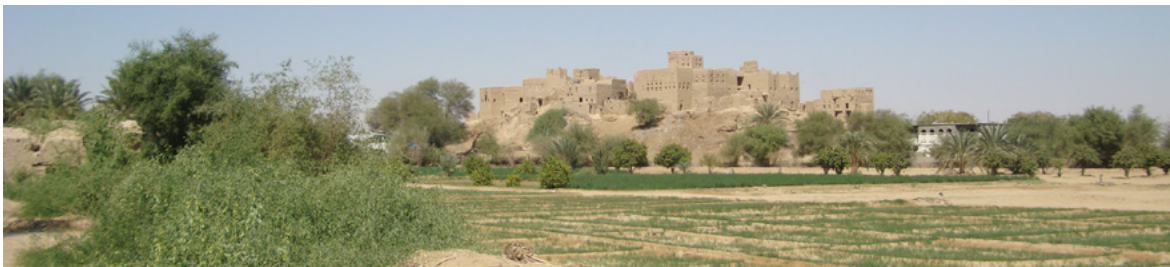
A small village in Shabwa Province in southeast Yemen.

and killed tribesmen—all very serious offenses according to tribal law. 107 The Houthis have levied taxes and forced their own preachers into local mosques, imposing their slogan of “Death to America; Death to Israel; Curse the Jews; Victory to Islam.” All of this is extremely provocative to the tribes. 108 The Houthis have further insulted the tribes by labeling those who reject their presence in al-Bayda’ as Dawa’ish , a term derived from “Daesh” (the Arabic acronym for the Islamic State), that describes those alleged to adhere to its jihadist ideology. By contrast, from the perspective of the affected tribes, AQAP generally has addressed them with relative respect. 109 While the Houthis have routinely violated tribal honor, AQAP, in the view of these tribes, has helped to defend it by fighting to expel the rebels from tribal areas. To the tribes struggling against the Houthis, AQAP is a problem to face tomorrow, while the Houthis—whom they see as outsiders from the north seeking to grab power and rule them—are an existential threat today. 110