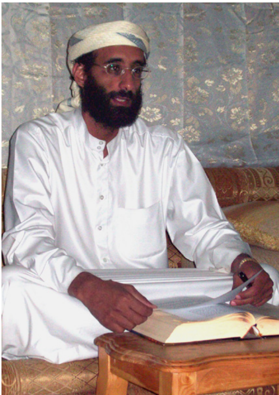
Al-Qaeda propagandist Anwar al-Awlaqi in Yemen, October 2008. Al-Awlaqi, a U.S. citizen, was killed in a U.S. drone strike in 2011.

al-Qaeda as members of AQAP are required to do, and could operate with flexibility, maintaining an official distance from the group. Through AAS, AQAP sought to build trust