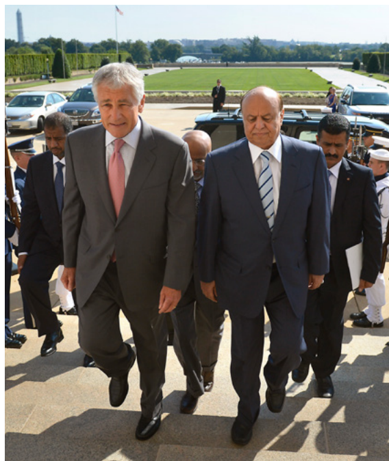
U.S. Secretary of Defense Chuck Hagel and President Hadi entering the U.S. Defense Department, July 2013.

The United States also failed to prioritize poor governance and rampant corruption within Saleh’s government as it invested significant funds in his regime. According to publicly available figures, the United States has provided Yemen about USD $1.83 billion in bilateral security and economic assistance since 2002. 122 (This figure does not include funding attached to alleged significant classified programs in Yemen operated by the Defense Department.) Most of this USD $1.83 billion was for security assistance; only a small portion was meant