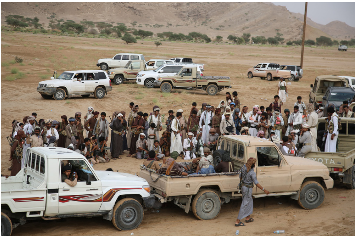
Ma'rib tribal congregation demanding government justice after two tribesmen were killed in clashes with another tribe, August 2016.

tribes do not oppose the central government. Yemen's tribal law prohibits mobilizing fighters against the state, and for this reason, tribesmen rarely attack government facilities or soldiers. 62