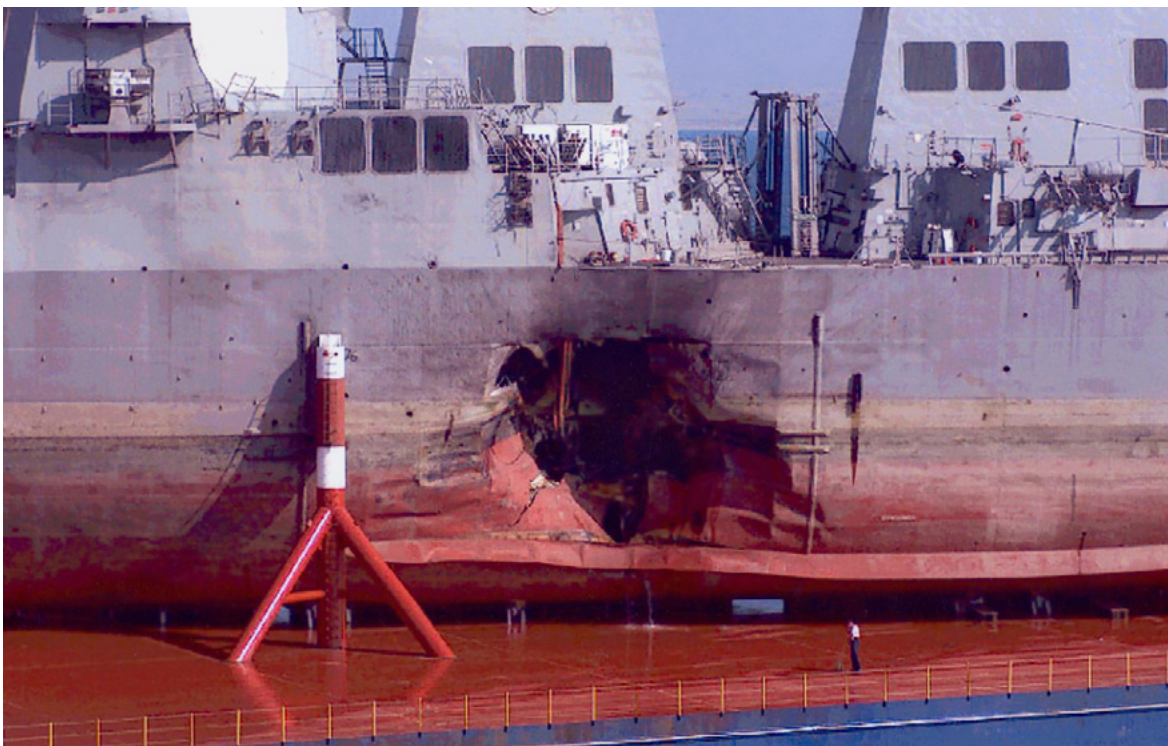
The naval destroyer USS Cole was attacked by an al-Qaeda suicide bomber in Aden port in October 2000.

analysts believe that elements within the Saleh regime had helped them. 20 Among the escapees were close bin Laden associates Nasir al-Wuhayshi and Qasim al-Raymi, each of whom went on to lead AQAP. 21 (Al-Wuhayshi was killed in 2015 by a U.S. drone strike; al-Raymi, his successor, remains at large.) Following the