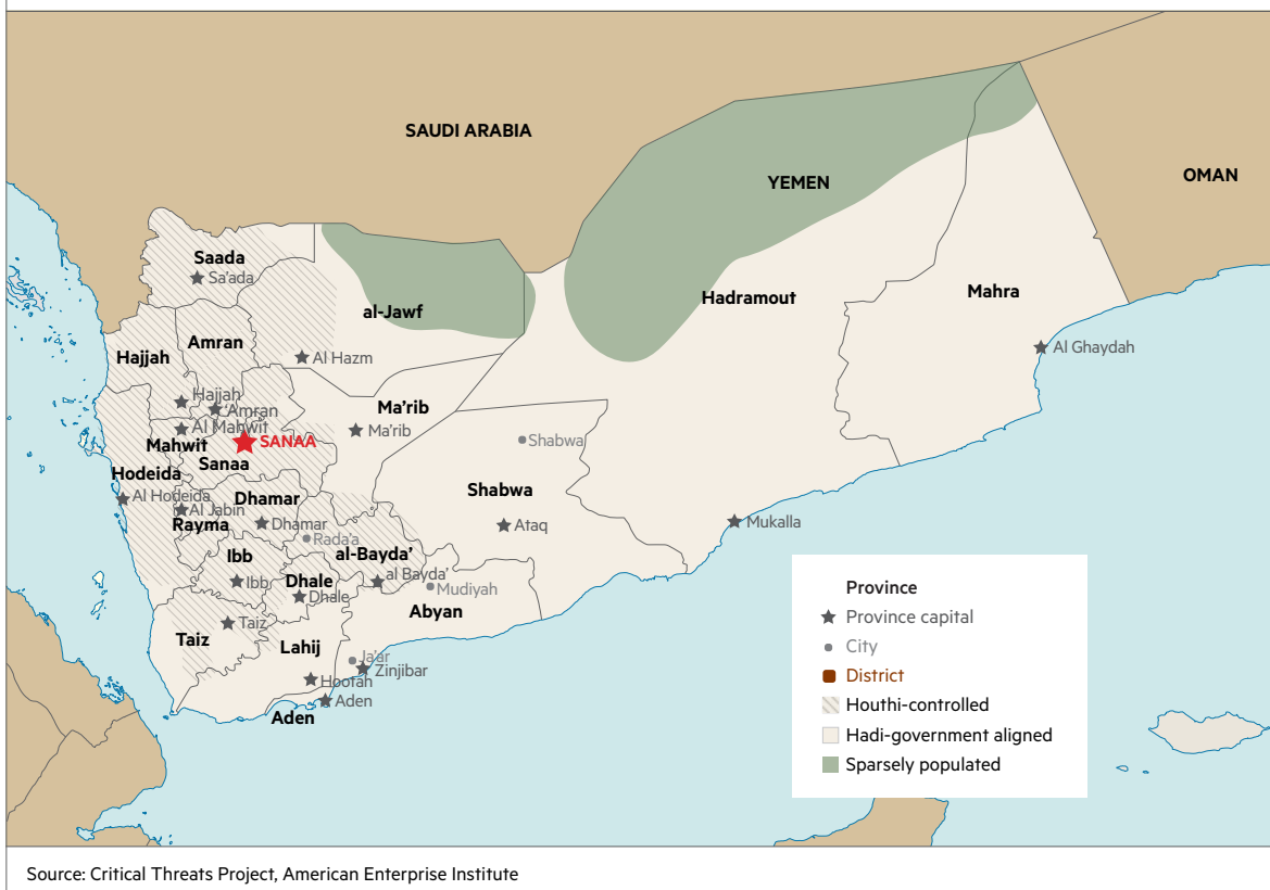
FIGURE 1. PROVINCES AND KEY CITIES IN YEMEN

The U.S. campaign has killed a sizeable number of top AQAP operatives, disrupted the terrorist group's plots, and hindered its activities—and caused the death and injury of many innocent Yemeni civilians. But it has not vanquished AQAP. In fact, al-Qaeda's presence in Yemen has expanded from a small cluster of jihadists in the early 1990s, to two to three hundred AQAP members at the group's 2009 inception, to a well-funded and tenacious terrorist organization with as many as 4,000 members today. 6