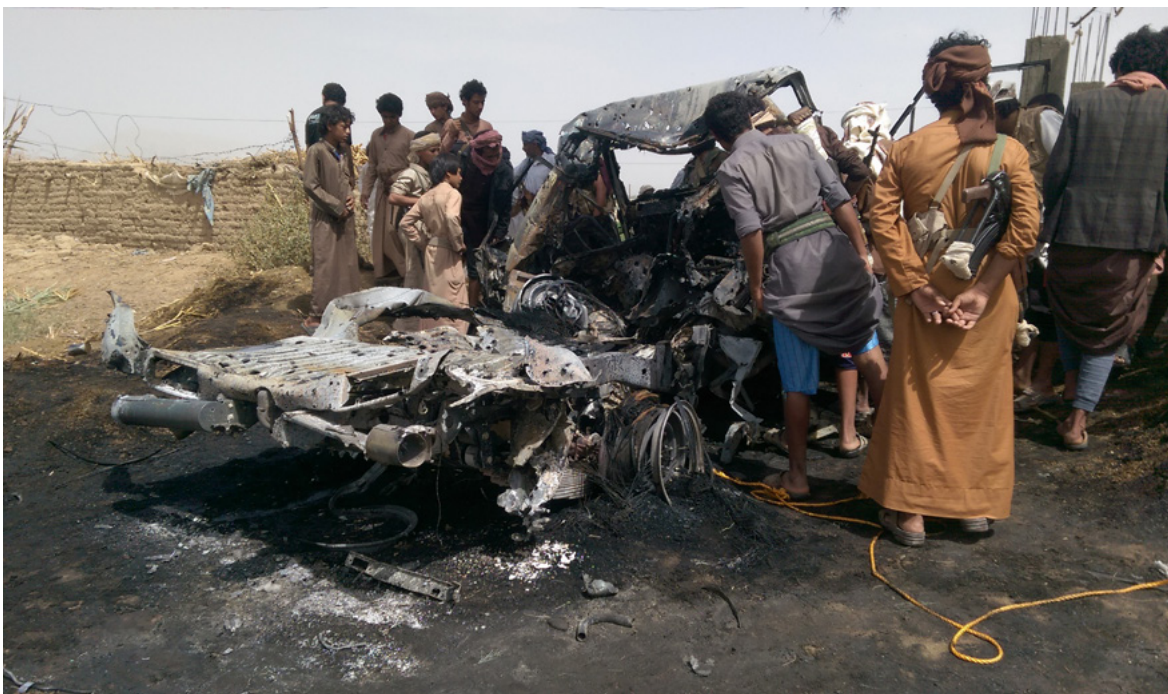
Tribesmen examine the aftermath of a drone strike in the village of al-Manein, Ma'rib Province, April 2016.

apprehend al-Raymi or any other high-value AQAP target. 143