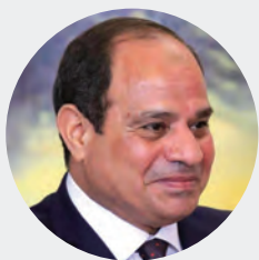
Abdel Fattah al-Sisi