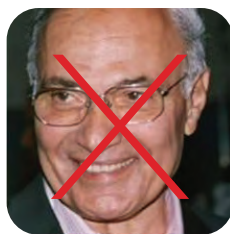
Ahmed Shafik • PRIME MINISTER 2011

After announcing his bid on November 29, 2017 , Shafik was deported by the UAE to Egypt and, upon arrival, was detained for several weeks by the Egyptian authorities. He withdrew his candidacy January 7, 2018 , after receiving threats from the government.