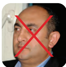
Khaled Ali • HUMAN RIGHTS LAWYER, ACTIVIST