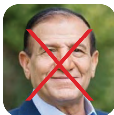
Sami Anan • ARMY CHIEF OF STAFF 2005-2012

During a January 15, 2018 press conference where Sadat was expected to declare his candidacy, he instead announced his decision not to run, citing fears about the safety of his campaign workers and doubts about the fairness of the process.